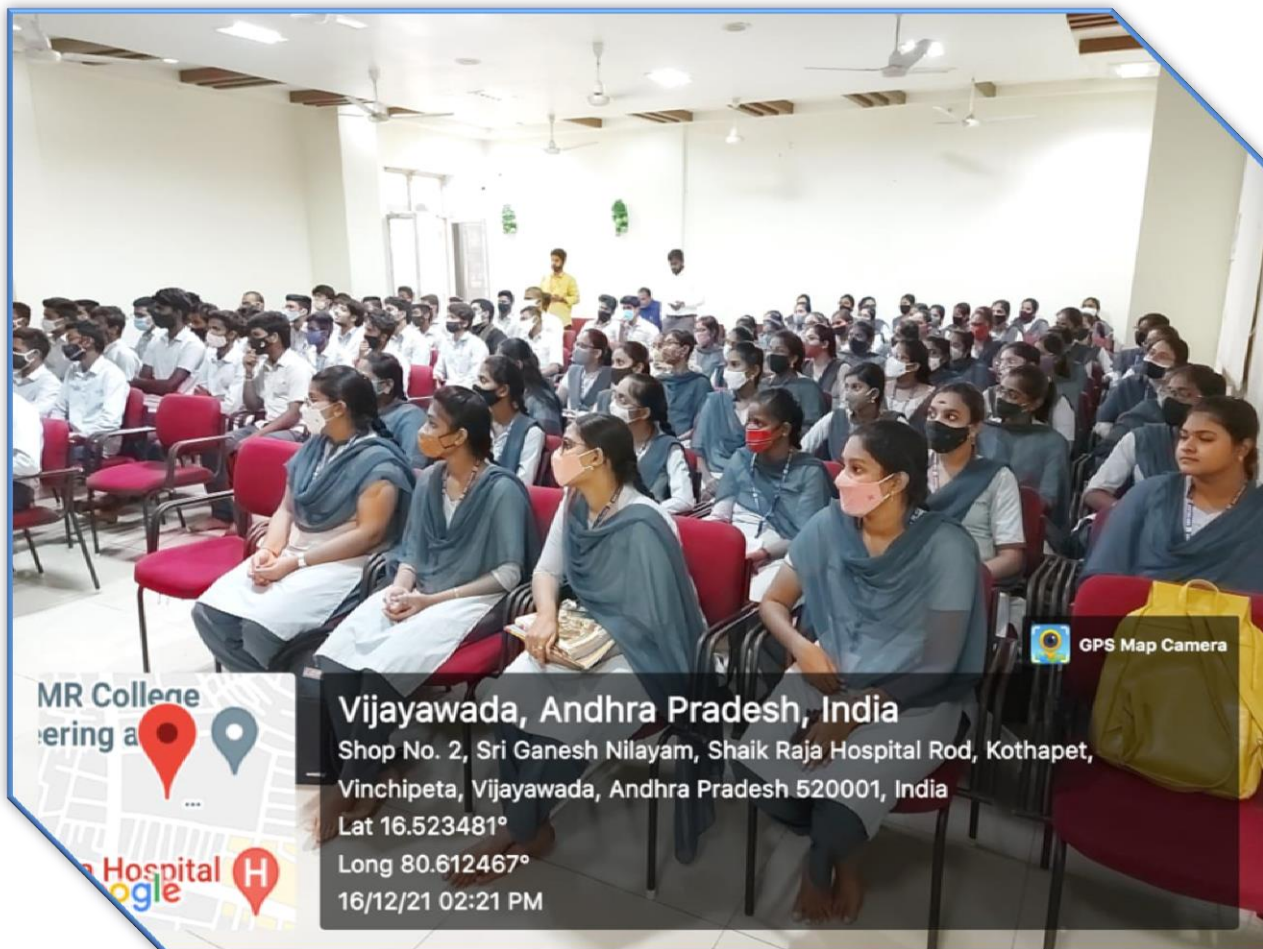
Students at the Virtual Guest Lecture